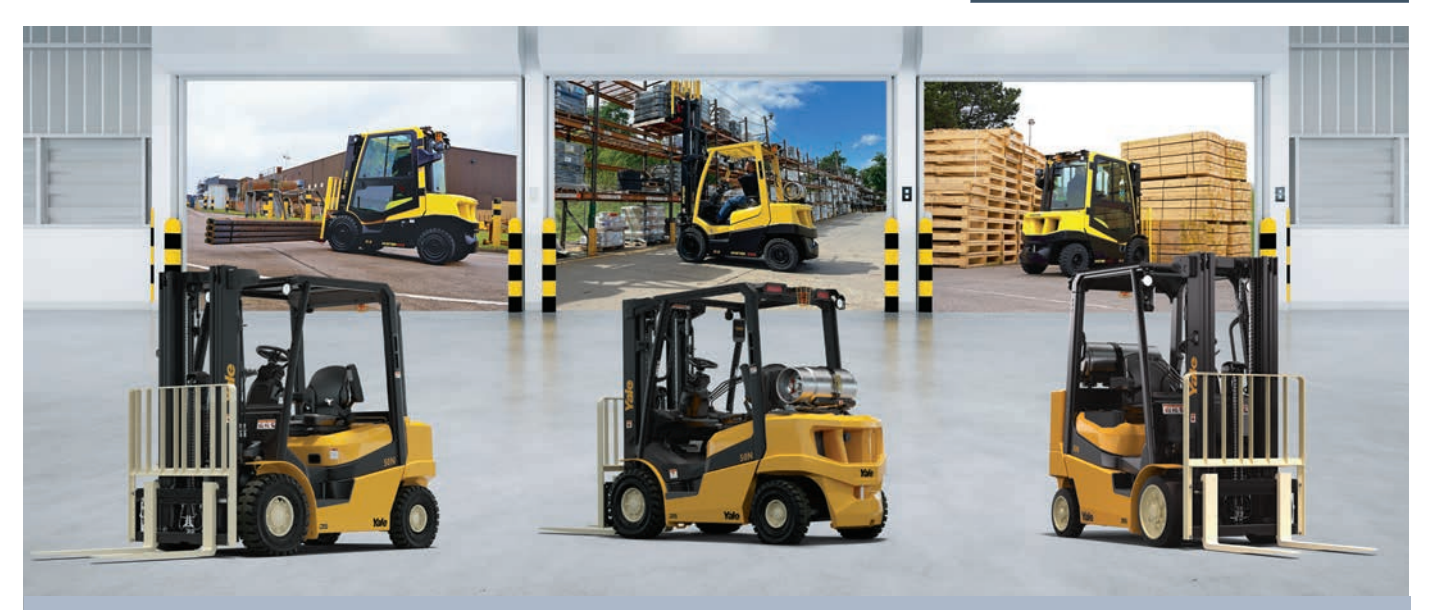
▲ Image above showcases multiple Hyster<sup>®</sup> A Series and Yale<sup>®</sup> Series N trucks all built on a modular, scalable platform, which allows lift trucks to be easily configured to match unique customer-specific requirements.

A Yale<sup>®</sup> ERC050VGL, fully-integrated lithium-ion lift truck is shown loading product into a trailer. • Hyster<sup>®</sup> and Yale<sup>®</sup> brand logos displayed at the Hyster-Yale Experience Center in Charlotte, North Carolina – a customer-centric facility dedicated to showcasing Hyster<sup>®</sup> and Yale<sup>®</sup> solutions, which also serves as a state-ofthe-art training and meeting facility.